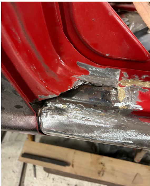
Section removed from the bottom of the B-post, to allow realignment of the rocker panel.

where they meet the rear valance by the tail lights, the valance was \frac{1}{4} " short on top and \frac{1}{4} " long on the bottom.