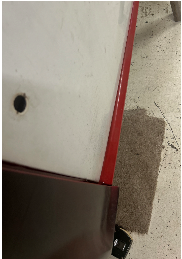
You can see the panel misalignment, with the red rocker panel well inside of the black fender line.

The problem was, he did not leave the doors on when he fit the rocker panels and the end result is a terrible fit. He also replaced the rear valance and must not have test fit the rear fenders as