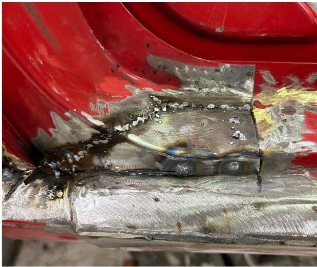
Patch welded into place, reconnecting the B-post and rocker.