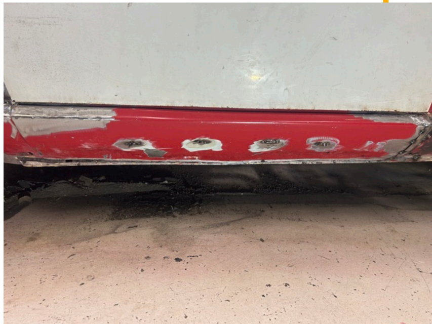
Realignment was required in 2 dimensions: the rocker is also now parallel to the door, with an even gap front to back.

I have only begun but my goal is to have it on the road by July.