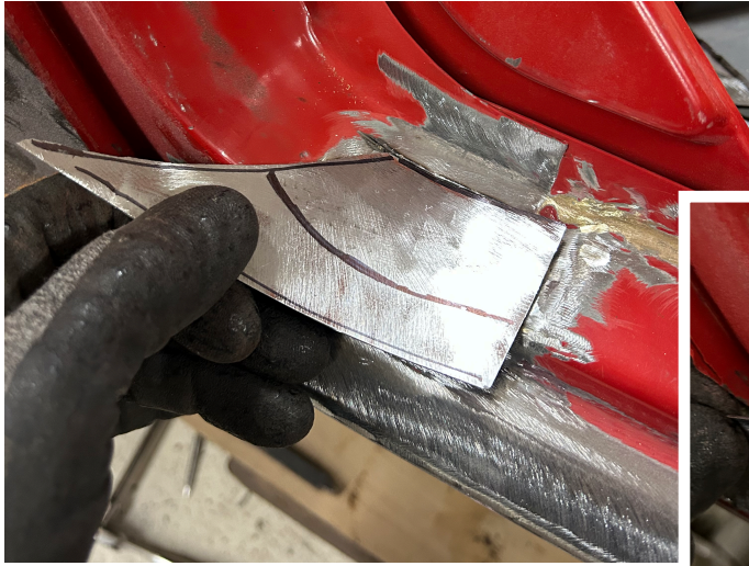
Rough cutting the new patch panel, marking the bend and curve lines.