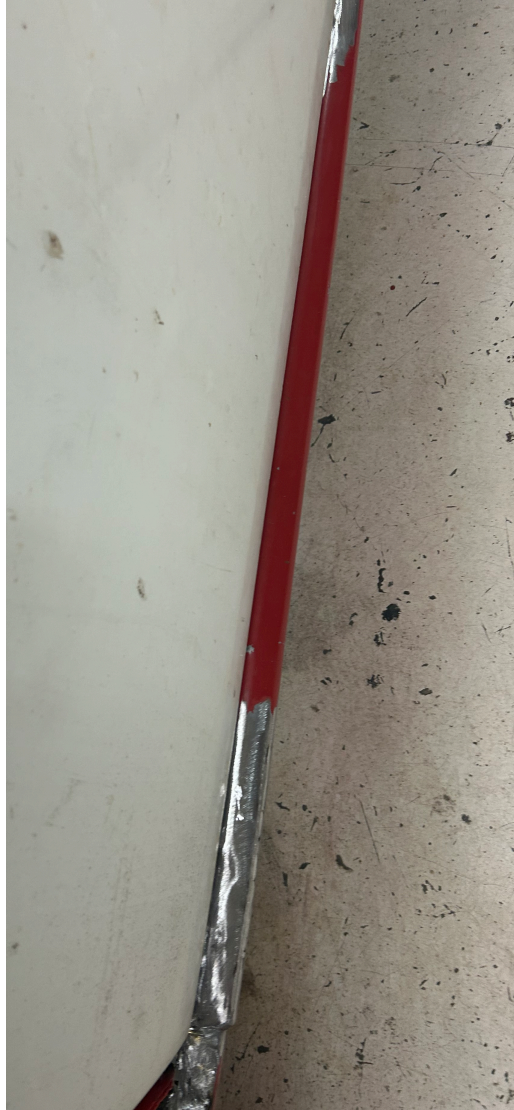
Realigned rocker panel, now with a continuous straight line through the fender

I started by changing some body mount pads and using a bottle jack to move the top of the firewall forward as I think when the floor and rocker were removed, it sank a bit allowing the top to rotate rearward. I was able to get the doors to latch as when I got it this was not possible.