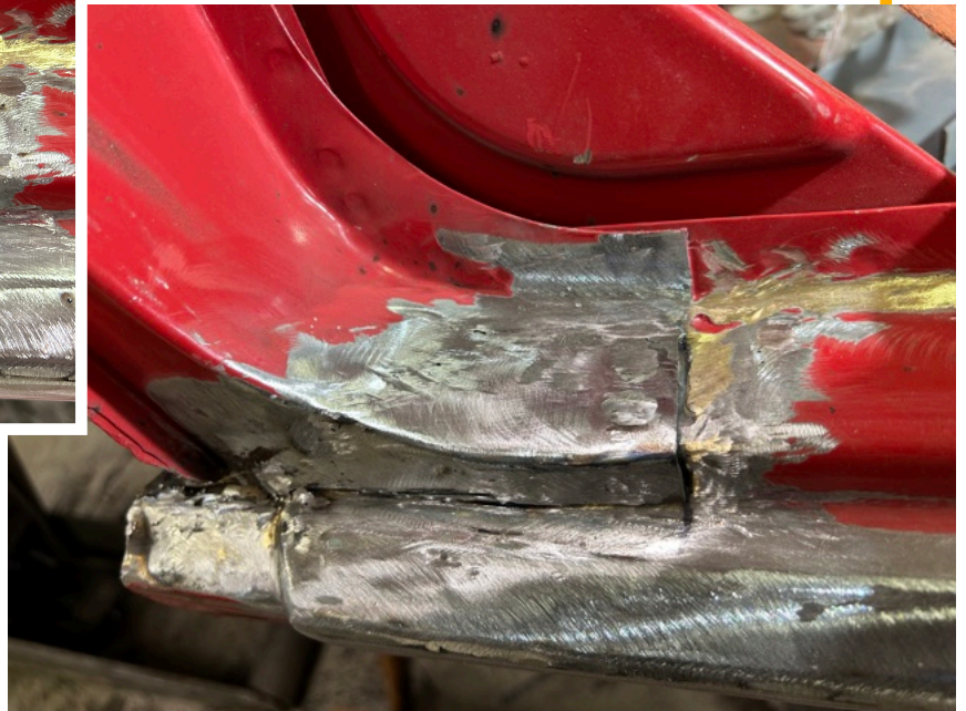
Welds ground smooth, ready for body work.