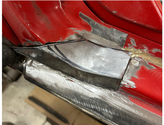
Forming the patch to fit the curves and the new attachment point for the rocker.