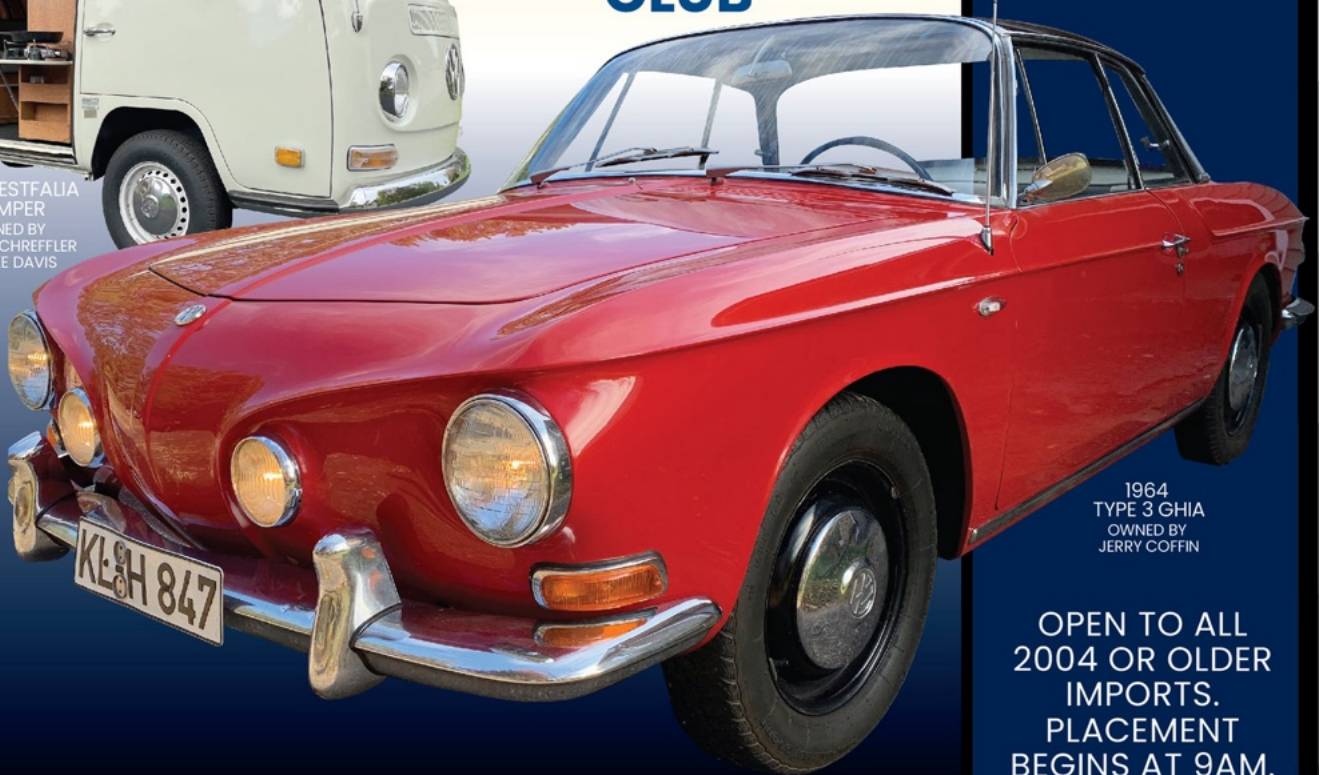
1964 TYPE 3 GHIA OWNED BY JERRY COFFIN