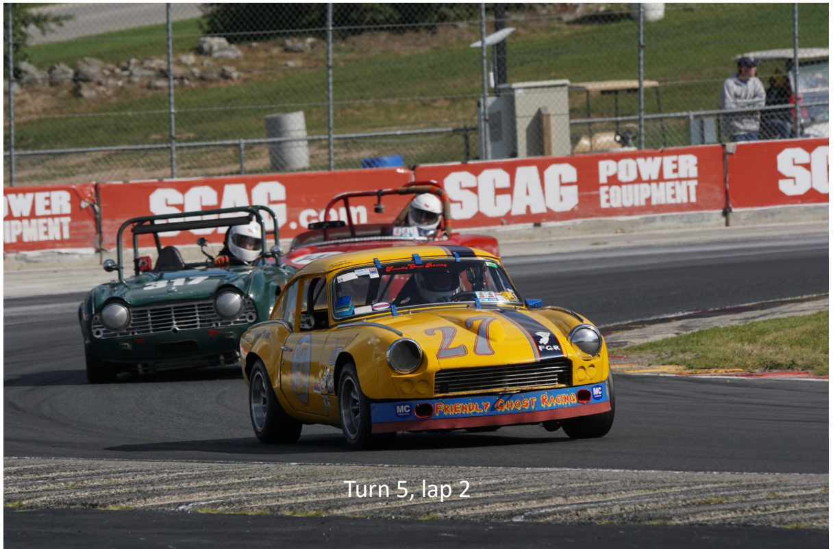
Turn 5, lap 2

Turn 5 braking zone was reduced to the inside only. To my surprise, all my laps were right near 3:00 minutes. I had raised my tire pressures by one pound and that made a big difference with the little bit of understeer I was experiencing under hard cornering.