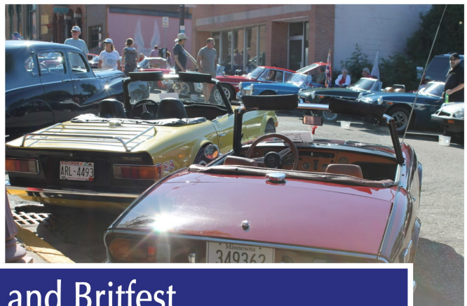
MTSCC Picnic and Britfest Good turnout and weather in Hastings and Hudson.