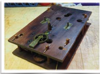
Showing the complete movement with walnut face plates. Note the sparse use of brass.

Well, take a gander at this, a wooden clock works built more than 200 years ago by the Eli Terry Clock Company. American clock makers were forced to use available materials because England was strictly controlling the export of metals to the United States. This clock belongs to an old friend of mine and I have made many repairs on it over the years. He now lives in Florida and could not find a clock shop willing to do the work. So he shipped the movement to Minneapolis. Yes, it was heavily insured.