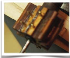
Pins in place, two for each cog

This time I tried something different. I molded the cogs in place with epoxy in a form made with plasticine clay, using a good cog as the master. Before using the epoxy, however, I inserted a couple of brass pins to give the epoxy something to grab.