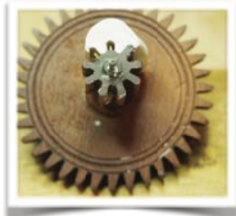
Mold in place