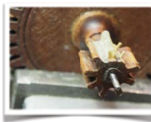
One tooth done, one to go.

I have to admit, I didn't give this much of a chance of working, but it is not nearly as invasive as cutting a slot for new teeth, so I thought, "What the heck, I can always Dremel it out if it fails". But it worked. The gear runs smoothly meshing with its mate. Fortunately my friend was OK with this non-traditional repair.