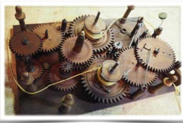
The moment less the front plate.