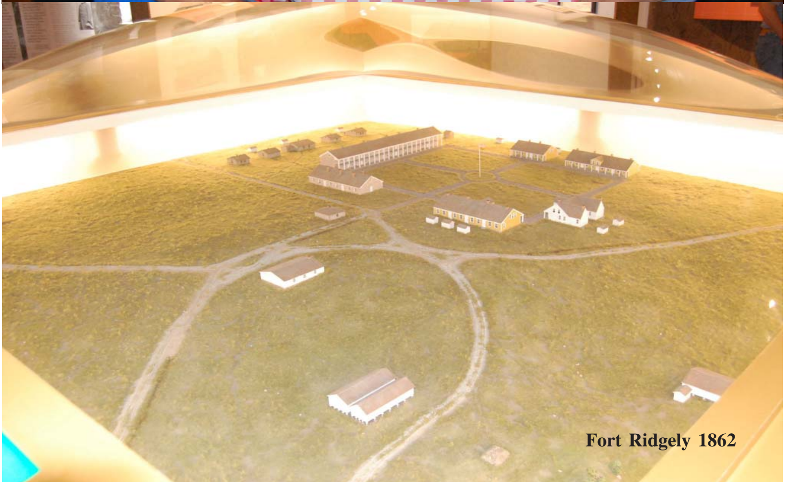
Fort Ridgely 1862