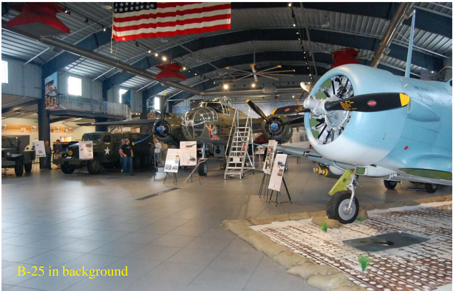
B-25 in background