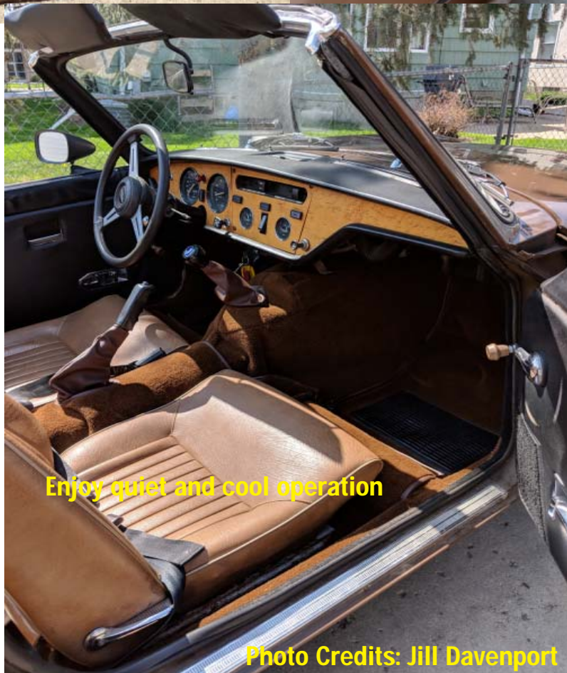
Enjoy quiet and cool operation