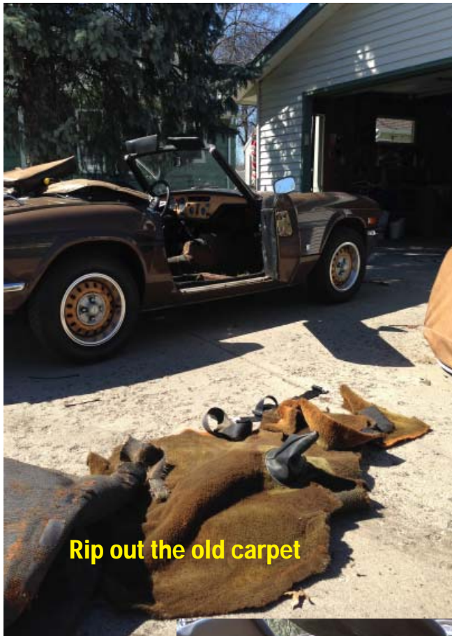
Rip out the old carpet