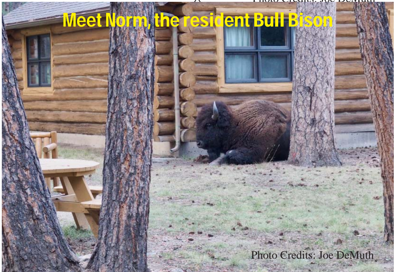
Meet Norm, the resident Bull Bison