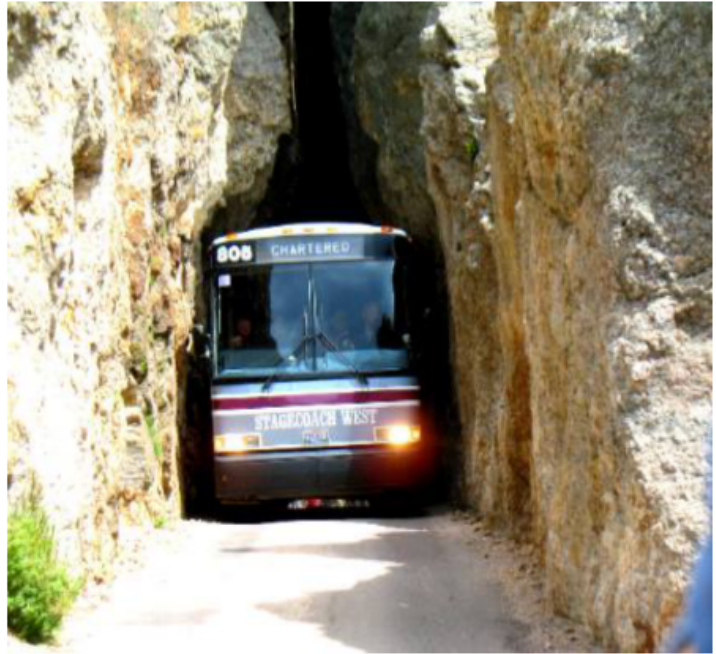
Tour bus in the Needles tunnel.

"Don't surrender to peer pressure and put the top up," Joe D while driving up Spearfish Canyon.