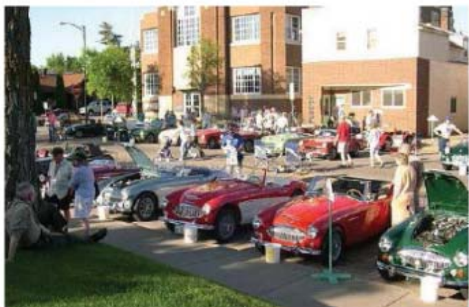
Friday’s “Sweet Sixteen” Downtown Car Show will be a fundraiser for Grand Rapids area Boy Scouts.

Register Now: www.mnhealey.com/rendezvous