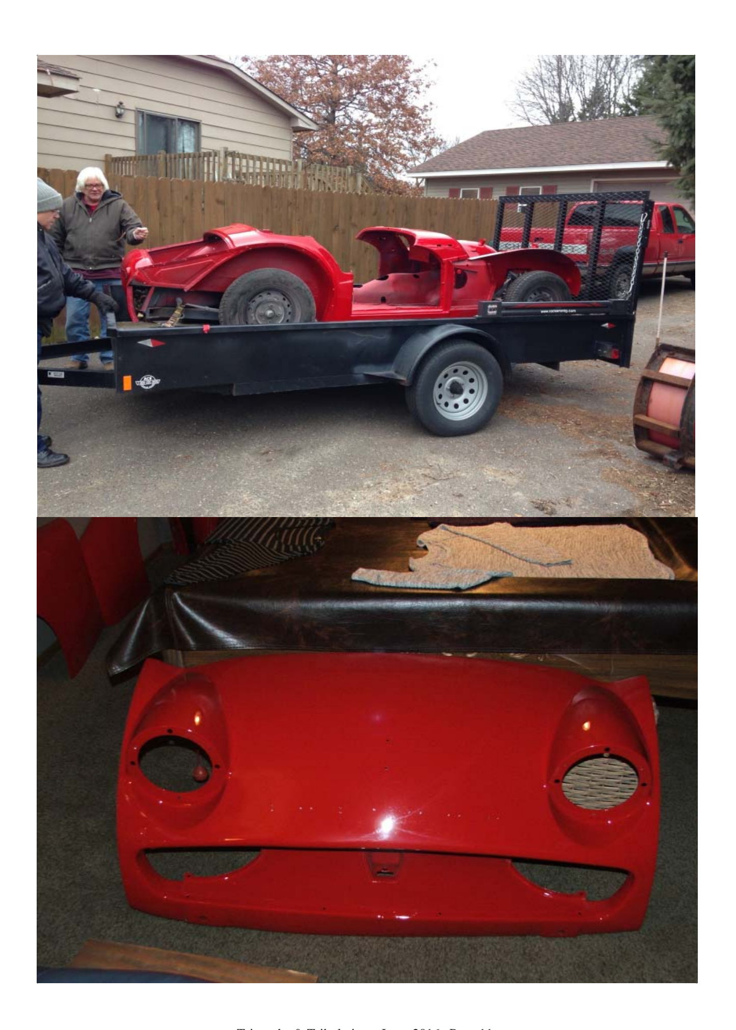
Triumphs & Tribulations, June, 2016, Page 11