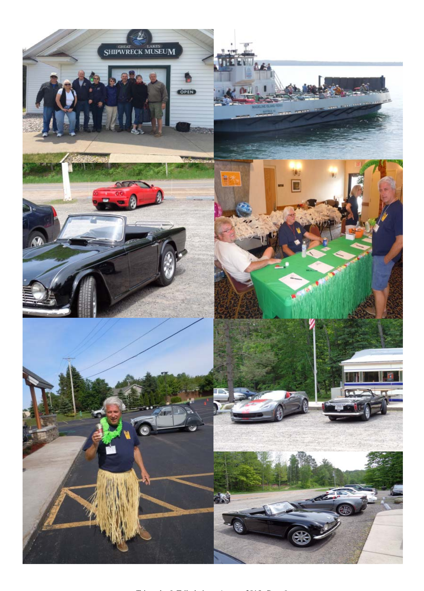
Triumphs & Tribulations, August, 2015, Page 9