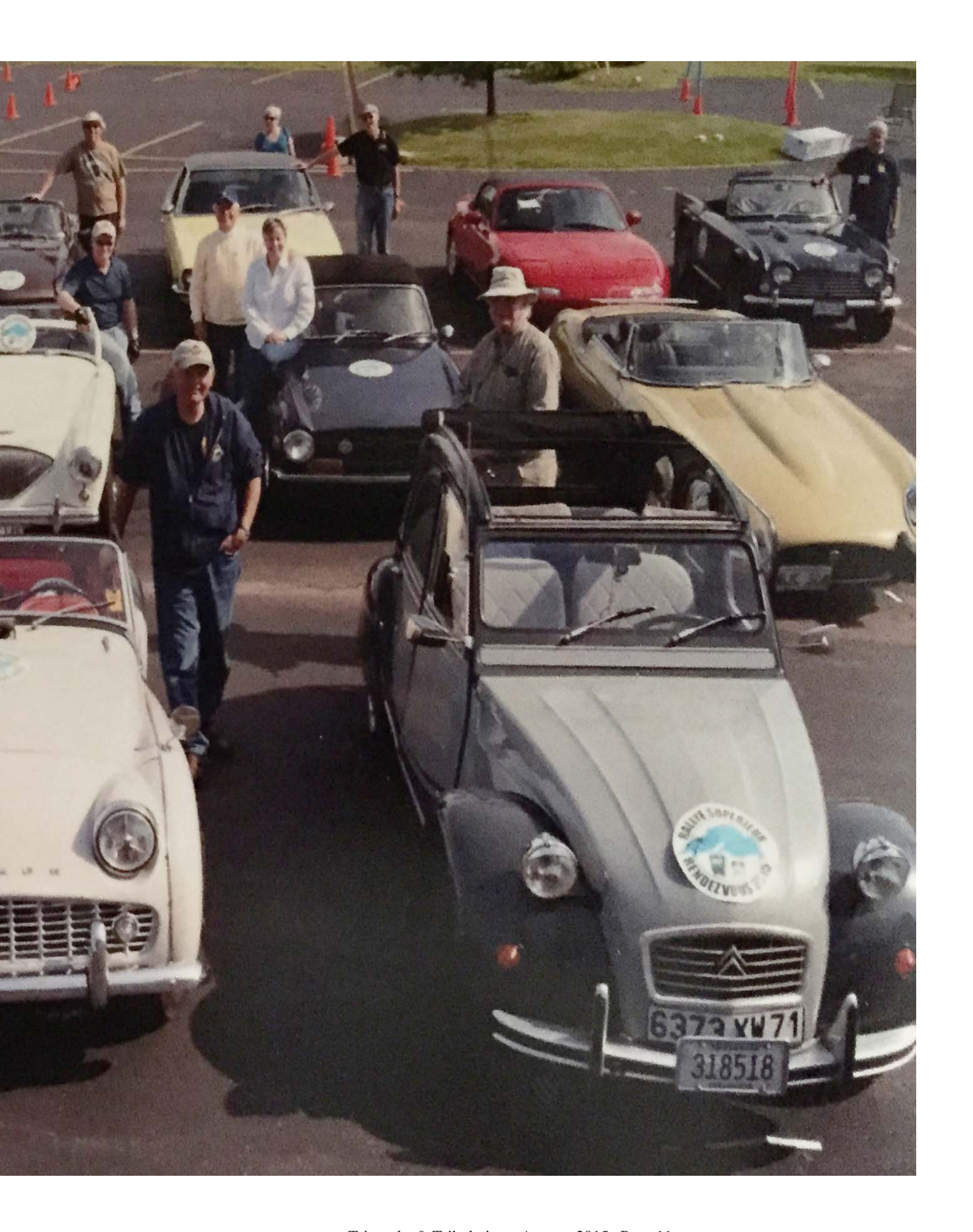
Triumphs & Tribulations, August, 2015, Page 11