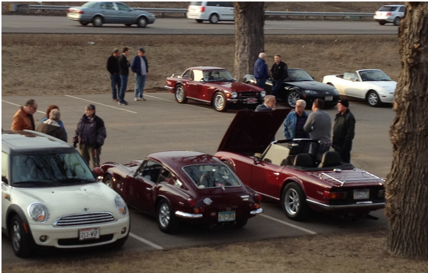
Triumphs at the March meeting. Ain't winter in Minnesota great?