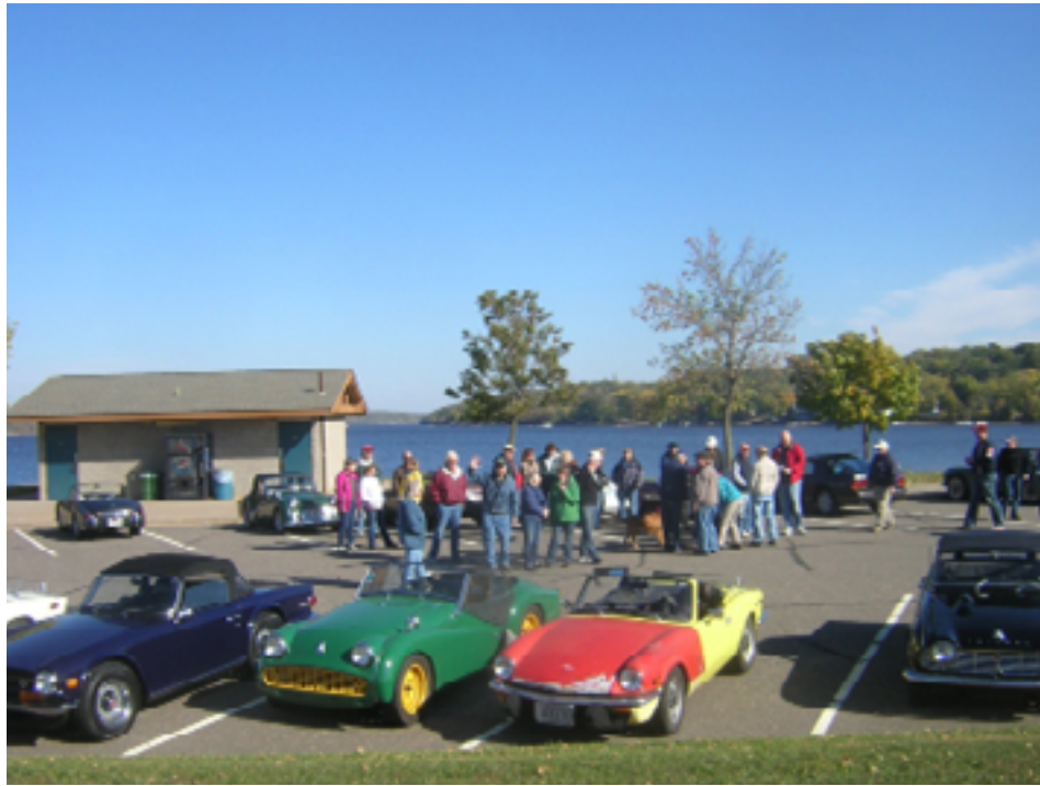
A good sized batch of Triumphs

The 2014 Colour Tour was a very well attended event. The day started off bright and sunny, with something in excess of 25 cars gathering at Pt Douglas Park just across the river from Prescott WI. From there we went south across the new river bridge in Hastings, and out in the general direction of Red Wing. Passing the turn off to Treasure Island, we ran down to Welch, and then on to Vasa. There we took a break to stretch our legs and check out the Vasa Lutheran Church. We then wondered further south and west before turning toward Red Wing once again. On the north side of Red Wing we stopped for lunch at the Smokin' Oak Rotisserie & Grill. The staff was not expecting us, but did a wonderful job of taking care of us. And the food was pretty good too! From there everybody chose their own route home. Good weather, great friends, great roads, and good food - a combination that is pretty hard to top.