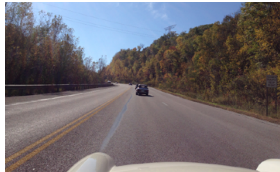
Past the Treasure Island turnoff, and up the hill toward Hwy 61.