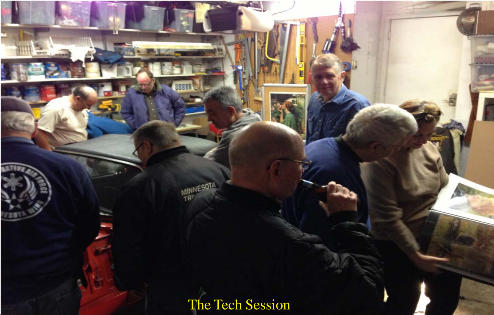
The Tech Session