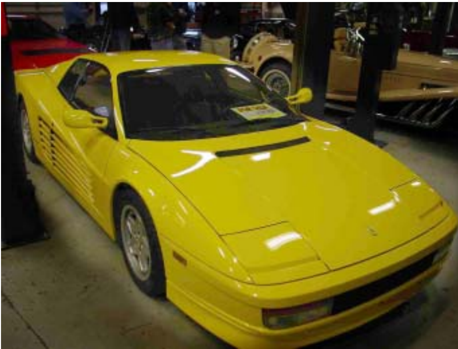
← Ferrari Testa Rossa. For Sale. A very nice red head dressed in fly yellow