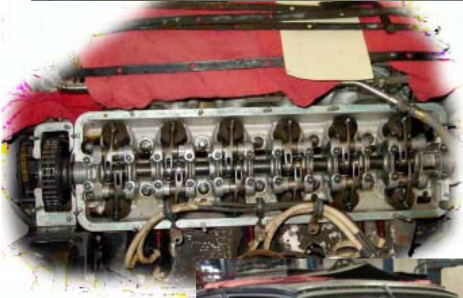
A Ferrari 375 twelve cylinder engine undergoing a little work. Wish I knew what that piece of paper says.