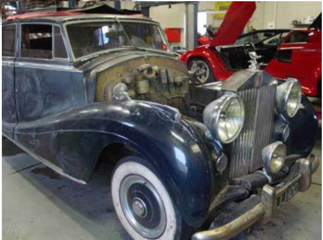
A Rolls Royce awaits its new pistons.