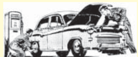
Open Bonnet and other reports begin on page 4

We're going to try the Open Bonnet system on one or two shows every month. We're open to suggestions for altering the OB and also welcome criticism and corrections of our coverage. Signed communications will be printed