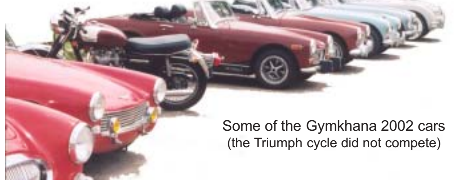
Some of the Gymkhana 2002 cars (the Triumph cycle did not compete)

7. Ambiance. (2 points) Only the self-declared "senior" cars had to park on blacktop; the rest of us were in a nice grassy area, close to the vendors. The Minis even found some shade, and