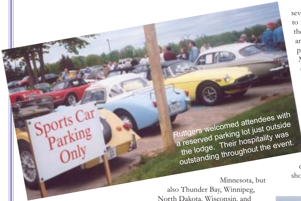
Ruttgers welcomed attendees with a reserved parking lot just outside the lodge. Their hospitality was outstanding throughout the event.