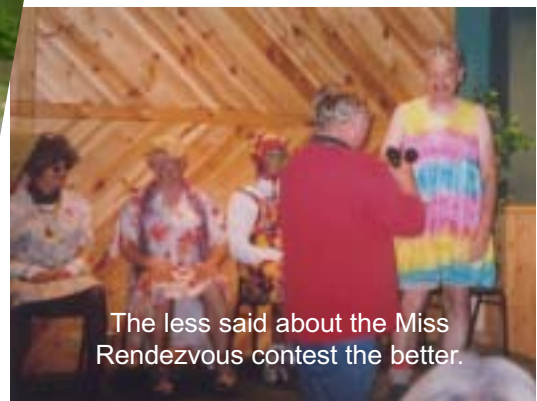
The less said about the Miss Rendezvous contest the better.