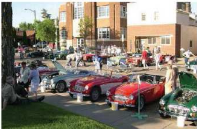
Friday’s “Sweet Sixteen” Downtown Car Show will be a fundraiser for Grand Rapids area Boy Scouts.

Register Now: www.mnhealey.com/rendezvous