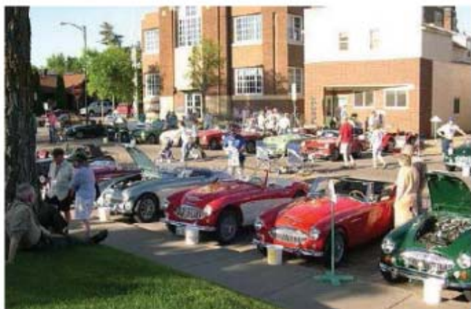
Friday’s “Sweet Sixteen” Downtown Car Show will be a fundraiser for Grand Rapids area Boy Scouts.

Register Now: www.mnhealey.com/rendezvous